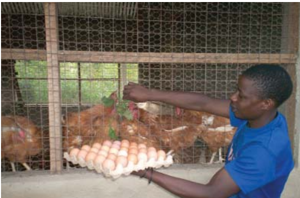
Gathering eggs in Bethany Village

Proper nutrition facilitates normal, healthy growth for children, both physically and mentally. We all know that we can only have a healthy mind from a healthy body.