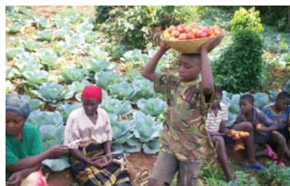
Children from the Bethany children's homes help with the farm harvest.

Similarly, ARM and Acres4Life have acquired a 466-acre property in war-torn north central Uganda, approximately 73 kilometers away from the capital city of Kampala. This land is seen as a means to meet the food requirements of ARM, other ministries and the people so desperately in need in this region.