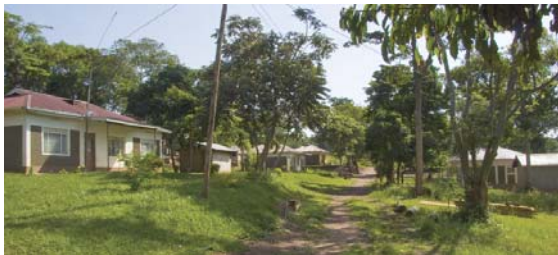
Several of the children's homes in Bethany Village.

There are now over 100 church plants in Uganda that have been started under the leadership of ARM and Gaba Community Church. And, lives are being transformed through the local church as ARM provides water wells, public healthcare and educational opportunities to the families of the village. The need for more people called to this ministry work resulted in the founding of Gaba Bible Institute. There pastors and Christian leaders are better prepared for the many ministry opportunities throughout Uganda and other parts of Africa.