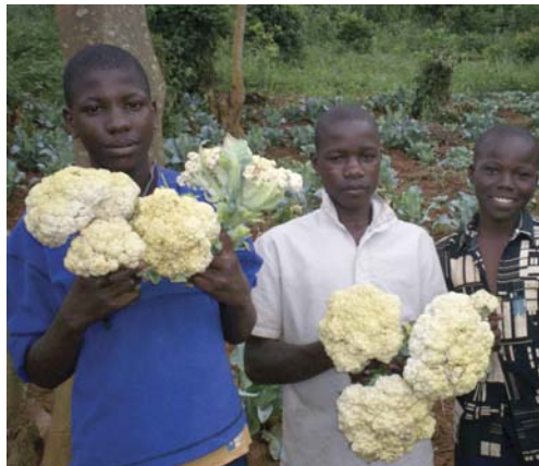
Boys from the Bethany children's homes bring in a harvest from one of the gardens.

Finally, Bethany's goal for the coming years is to provide adequate housing on-site for its staff. Currently much of the staff commutes in from rural areas because Bethany lacks suitable housing. We continue to pray for your generous support of the Bethany Village project. This mission has been blessed immensely and we know that the Lord will continue to meet our needs. If you would like to support the on-going success of this mission project, you can donate online at www.africarenewal.org or call 210-979-7441.