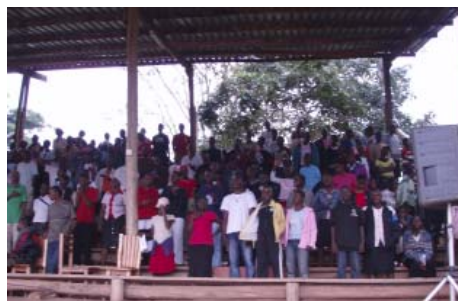
Students worship at a Bethany Youth Camp.

a purpose in the body of Christ. Each year Bethany Camp expands its programs and looks forward to future growth with your help, enriching the lives of even more children.