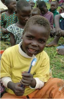
Holistically meeting the needs of a community is part of ARM’s Adopt a Village ministry.

There was a time in U.S. churches when “missions” meant sending money to American missionaries evangelizing people throughout the world. Occasionally a mission team from the U.S. would travel to a country to “do good works” for a few days, then return home to life as usual. But in the words of a 1960’s musical icon, “The times, they are a changing!”