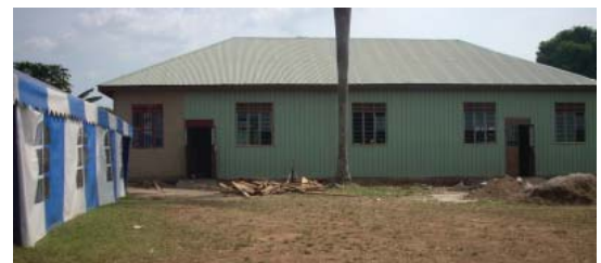
The new building for the church in Gulu. The original tent church is to the left.