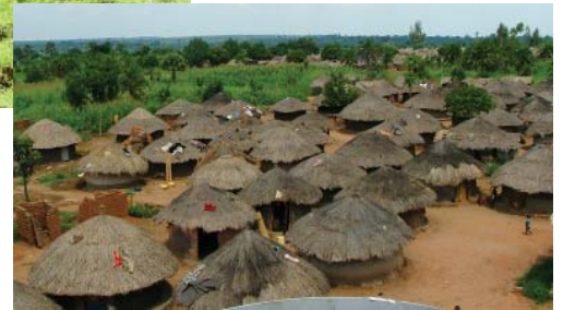
A portion of one of the IDP Camps in Gulu. The camps are overcrowded and unsanitary.