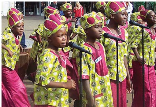
Mwangaza participates in a street concert in Holland in September 2007.

Mark your calendar! Mwangaza will be touring southern California this April for a six-week concert series, ministering to churches and carrying out fund-raising events with partners like Children's Hunger Fund and ARM, among others. The purpose of this tour is to generate funds, resources and friends for the on-going Mwangaza Ministry, to ensure that the "Message of Light" is shared by Ugandan children throughout the U.S. and other western nations on a year-round basis. The tour will also offer sponsorships for children and college students in the Next Generation Leadership Program.