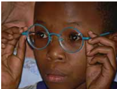
A student in Gaba receives glasses from Into Focus

Approximately one year ago, ARM staff met with Mubende district leaders to examine health aspects of village life and discovered that the people were suffering unnecessarily from unsanitary water sources, absence of vital vaccinations and a general lack of basic hygiene. In fact, no physician had visited the area in three years.