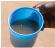
Drinking water before a well was dug

Working through the village churches, we've seen that the health of the child, family and community are all interwoven. We've come to understand that without a healthy environment in the community, much of our spiritual work bears little fruit. Christ gives us many examples of his meeting human needs first before spiritual transformation of the heart begins. For ARM, this translates into villages having access to clean drinking water, nutritious food and medical care, plus the community as a whole understanding the basic need for hygiene and cooperation in battling malaria and other preventable diseases.