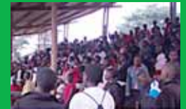
Students at Camp in Bethany Village

Help make Christmas and Camp a great time for all our kids! Send your donation by check marked "Christmas" and/or "Camp" in the enclosed envelope or go to africarenewal.org . 100% of donations go directly to the benefit of the children.