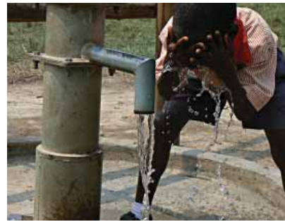
Clean water for ARM's school and the local community.

For more information on helping provide clean water to other communities, visit our website at africarenewal.org