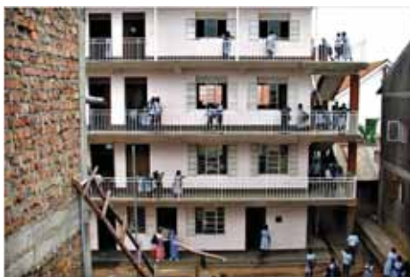
Maranatha Christian School in Gaba