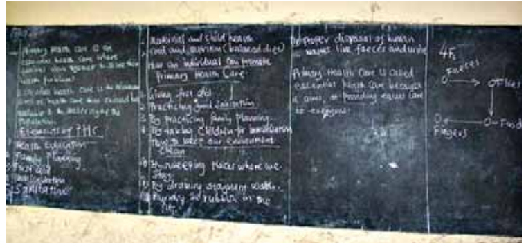
Blackboard health lessons at Maranatha Christian School

death for these children. In fact, most of these kids know someone personally who has been infected with HIV or malaria. One Ugandan teacher told me, "In Uganda, few are infected with diseases but all are affected by them."