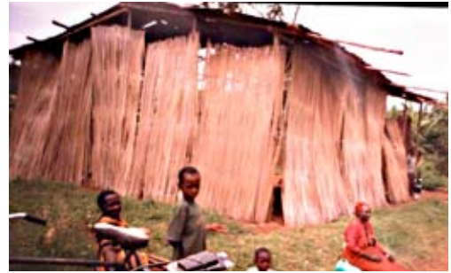
Mukono Community Church