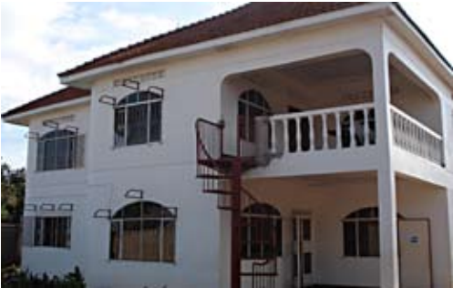
Gaba Bible Institute