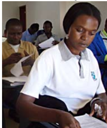
Students at Gaba Bible Institute