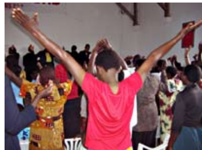
Pastors and Ministers worship during Mobile Bible School training in Rakai.

For many, the Mobile Bible School is the only opportunity some of the more remote pastors have to continue their education and training. Connecting with other church leaders for teaching and fellowship deepens their faith and dedication in their calling.