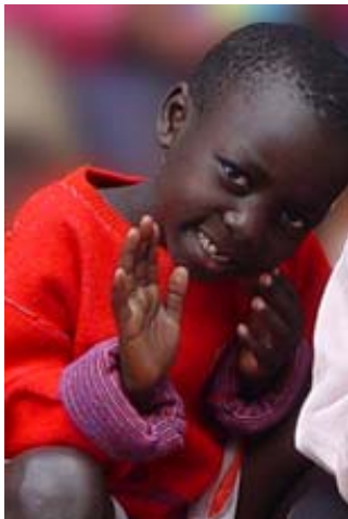
A young resident of one of ARM's children's homes