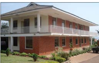
Wentz Medical Center, Ggaba, Uganda