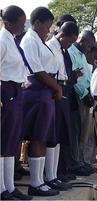
Some of the many professions of faith and rededications at Jesus Festival