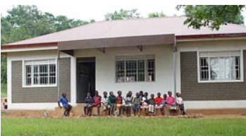
A completed children's home